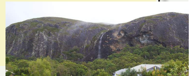
Mt Coolum waterfall