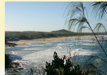
Mt Emu from Pt Perry