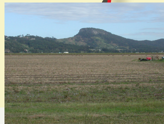
Mt Ninderry from the east