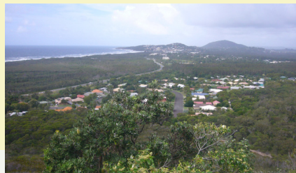
Mt Emu to town and Mt. Coolum