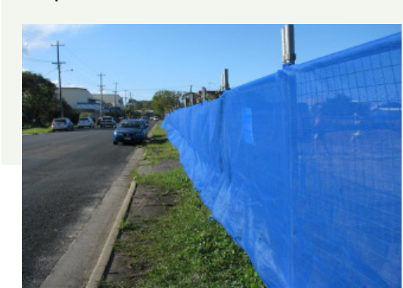
Heathfield St. - towards Birtwill St.

The path forming a link between these two main districts lacks permeability and local visual references emphasising and creating a sense of journey between places. The footpath connection is interrupted at several key points within the Village precinct making the pedestrian travel difficult.