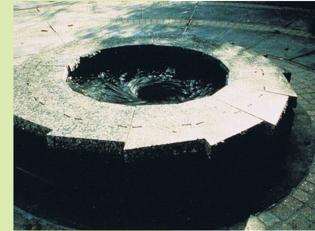
Ned Kahn, 1995 Encircled Stream - work suggesting the history of the flood cycles. (Fleming 2007)