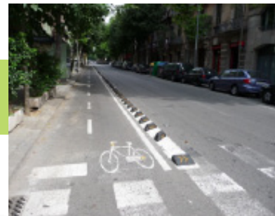
Barcelona - another solution

This brave design concept is inspired by how the local community were able to make the Cooloom Cliffs Boardwalk a reality. Community in action: creating valuable public space and celebrating the art of walking