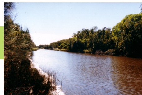
Stumers Creek and Noosa National Park