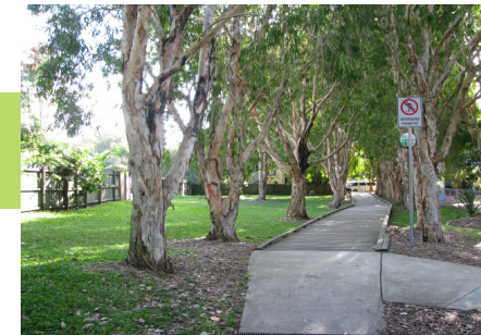
Along the path JMP