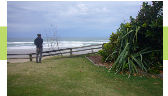
Tickle Park and the ocean