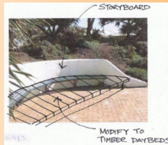
Revitalising seat to the north of the surfclub.

It is recommended that design solutions using the boardwalk construction be explored to connect the path in front of the surf club, allowing the old concrete walkway to be adapted as a reclining ramp down to the beach for all person access.