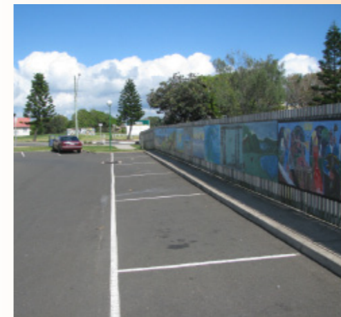
Caravan Park fence line

The short term suggestion is to acquire the parking bays along the caravan park fence line to Tickle Park and create a pedestrian path from the Beach, in front of the proposed Boardriders viewing platform, to David Low Way. It is suggested this path may incorporate an avenue of shade trees and another opportunity for an artist brief –ad-