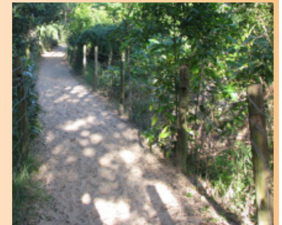
Beach access path Lions Park