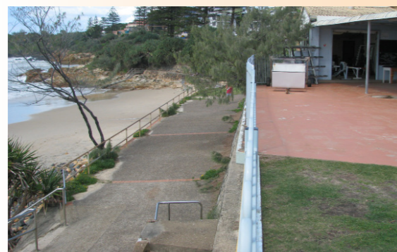
Lower path Coolum Surf Club

artist brief –addressing camping and transient placemaking.