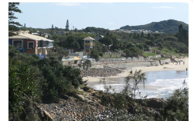
Coolum Surf Club and beach

artist brief –addressing camping and transient placemaking.