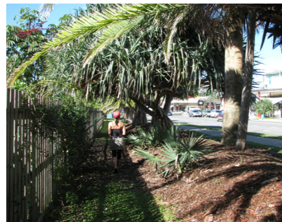
Caravan park fence and garden.