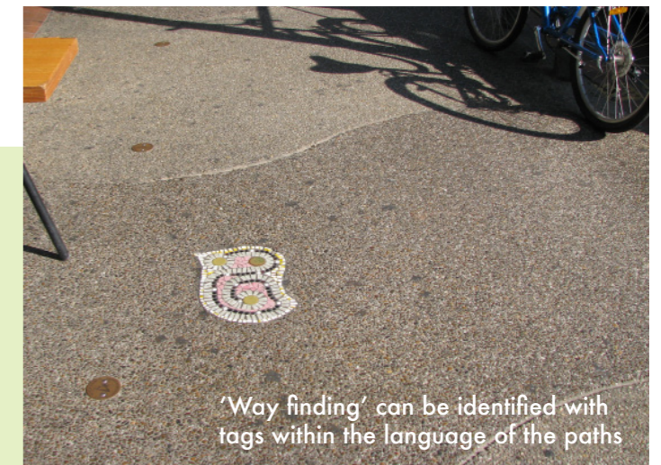
'Way finding' can be identified with tags within the language of the paths