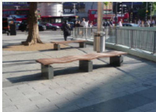
Skate-free seating London 2009

Make the connection between place and the online Picture Sunshine Coast collection currently being compiled by the SC Libraries Heritage unit. This image collection from the community could be archived within the 'Web Place' recommendation (pg 32)