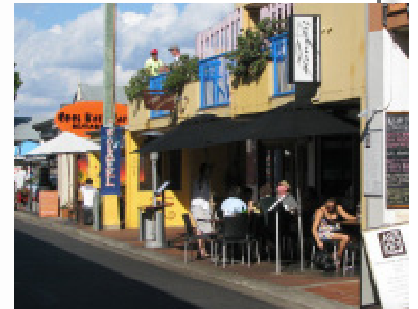
Byron Bay Laneway

ENCOURAGE MULTI-USE DEVELOPMENT UTILISING STREET AND SERVICE LANE FRONTAGES.