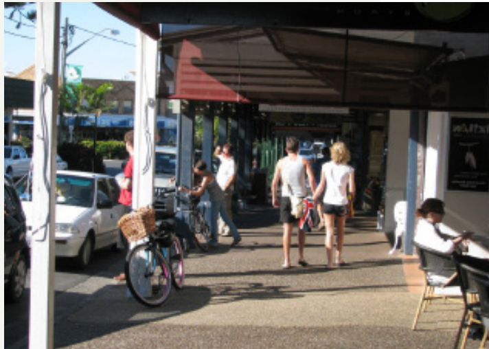
Byron Bay Main Street

A significant observation is that the multi-use three storey buildings tend to have greater articulation and enhance the function and appearance of the built form with pleasant human scale.