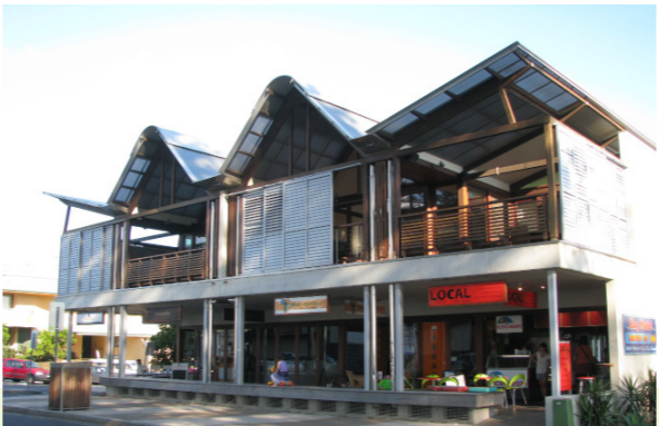
Recent development - Byron Bay