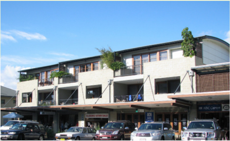
Recent development - Byron Bay

Roof pitches and eaves are addressed in the town plan. It may be appropriate to relax setbacks for verandahs, pergolas, and fixed awnings to encourage covered pedestrian paths around the commercial precinct and improve articulation of building forms. The 'Georgian Style' (no eaves, concealed gutters) building boxes should be weeded out of new development in Coolum and the town planning requirement for minimum depth eaves enforced. It is recommended that any visible roof mounted mechanical ventilation equipment should be provided within the Development Approval Documentation to assist in maintaining the integrity of the roof appearance.