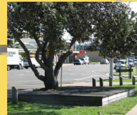
Seating and uplighting opportunity Tickle Park