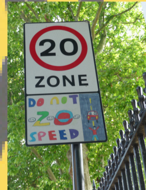
Greenich Village London