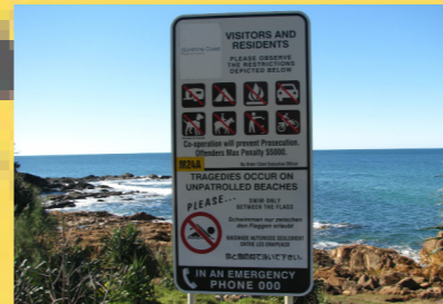
First Bay Coolum

Our recommendation is an attempt to reduce the negativity on signs in the community. We propose that a member of the urban design staff is made responsible for any public signage being erected so that a consistency and appreciation of views and vistas is maintained.