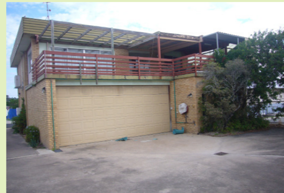
Rear view of the Ambulance Centre Williams St