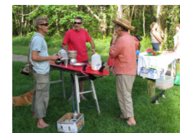
Bike week 2009